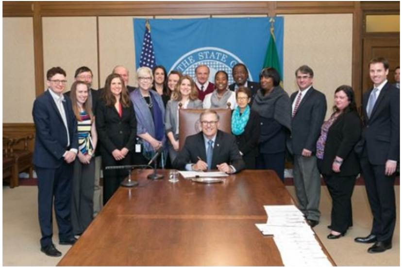
Bill signing 2ESHB 1553 Opportunity Restoration

Creates a statutory scheme by which a person with a criminal record can be granted a Certificate of Restoration of Opportunity (CROP). Establishes criteria for which one can become a qualified applicant for restoration. A qualified court may, in its discretion, determine whether to issue a certificate that applies to all past criminal history statewide or only to the convictions or adjudications in the jurisdiction of the court. The clerk of the court in which the certificate is granted must transmit the certificate to the Washington State Patrol identification system. State patrol must include any certificate as a part of its criminal history record report and is included within the definition of "Criminal history record information" within RCW 10.97.030. AOC is required to create relevant instructions and forms by January 1, 2017.