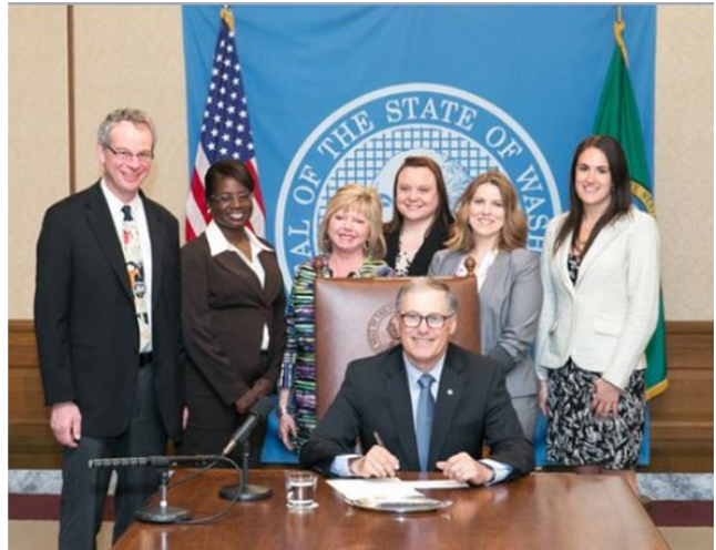
Bill signing HB 2371 Court Use of JIS System

Requires the court to order any person convicted or found not guilty by reasons of insanity of a felony firearm offense that was committed in conjunction with a crime involving sexual motivation, a crime against a child, or a serious violent offense to register in the felony firearm offense conviction database.